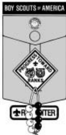
CUB SCOUT RIGHT POCKET

Conduct uniform inspections with common sense; the basic rule is neatness.