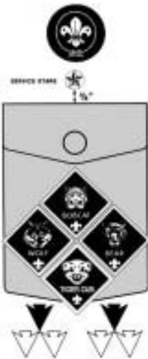
CUB SCOUT LEFT POCKET