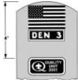
CUB SCOUT OR WEBELOS SCOUT RIGHT SLEEVE