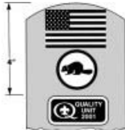
WEBELOS SCOUT RIGHT SLEEVE